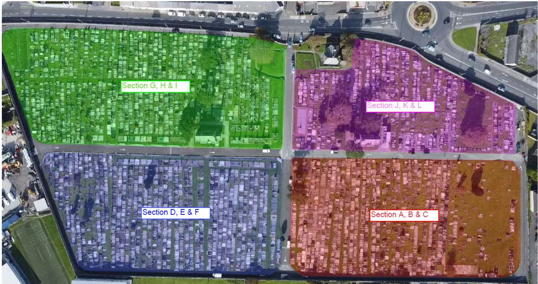
Bohermore Cemetery. Traditional/Kerbed Plot Sections A to L