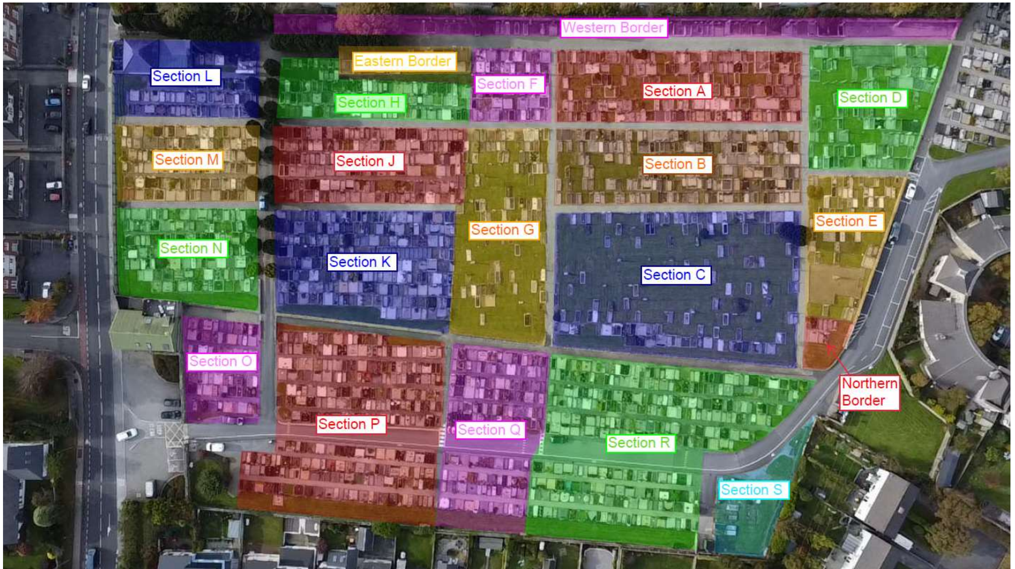
Ragoon Cemetery. Traditional/Kerbed Plot Sections A to S (There are no Sections I, T, U or V in Ragoon Cemetery)